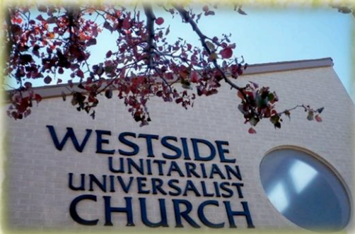
Our Spiritual Home